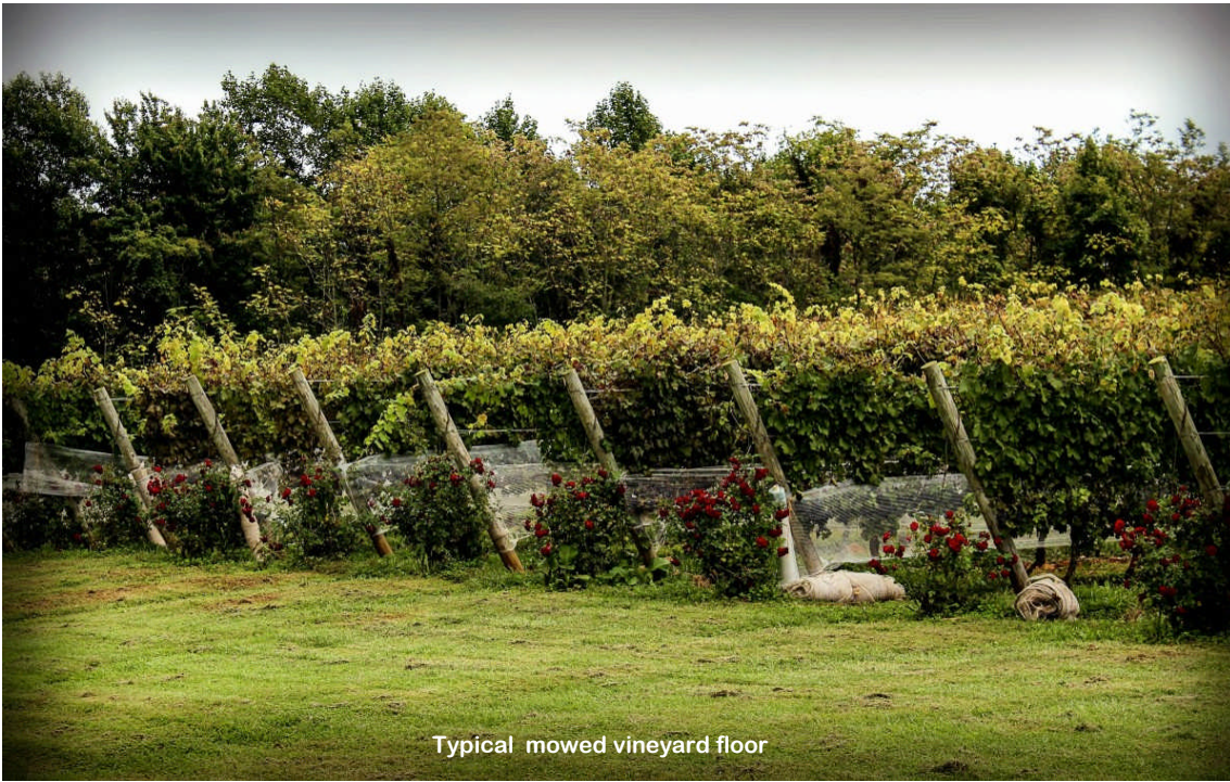
Typical mowed vineyard floor