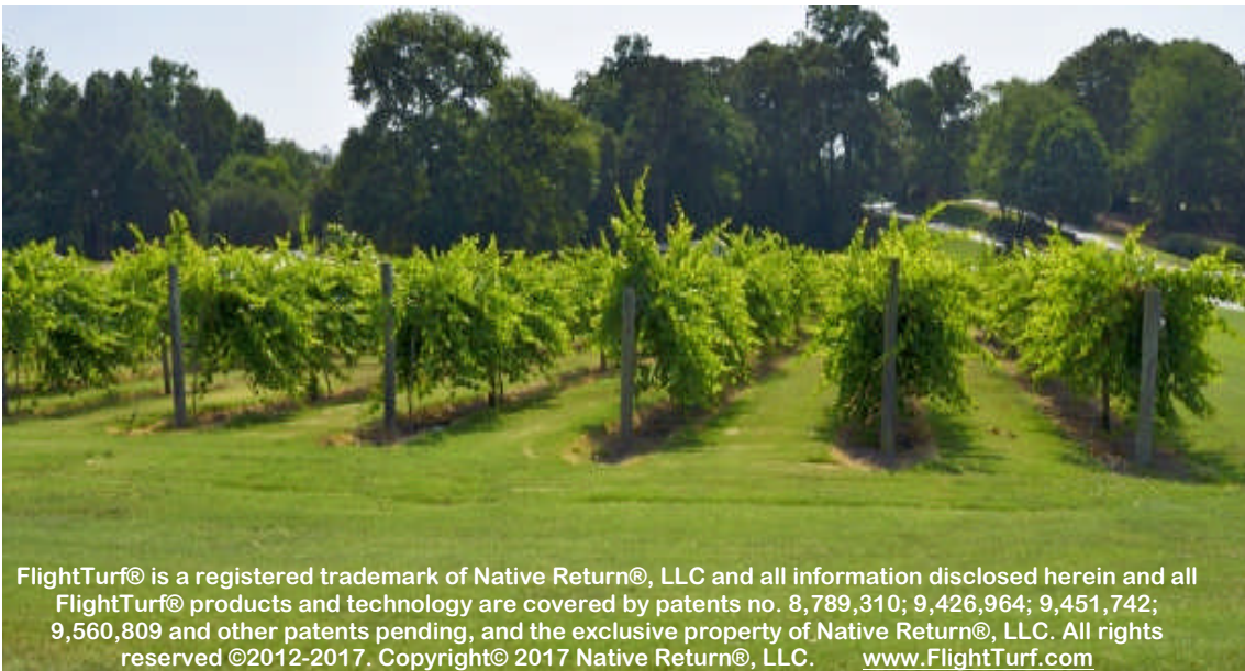
FlightTurf® is a registered trademark of Native Return®, LLC and all information disclosed herein and all FlightTurf® products and technology are covered by patents no. 8,789,310; 9,426,964; 9,451,742; 9,560,809 and other patents pending, and the exclusive property of Native Return®, LLC. All rights reserved ©2012-2017. Copyright© 2017 Native Return®, LLC. www.FlightTurf.com